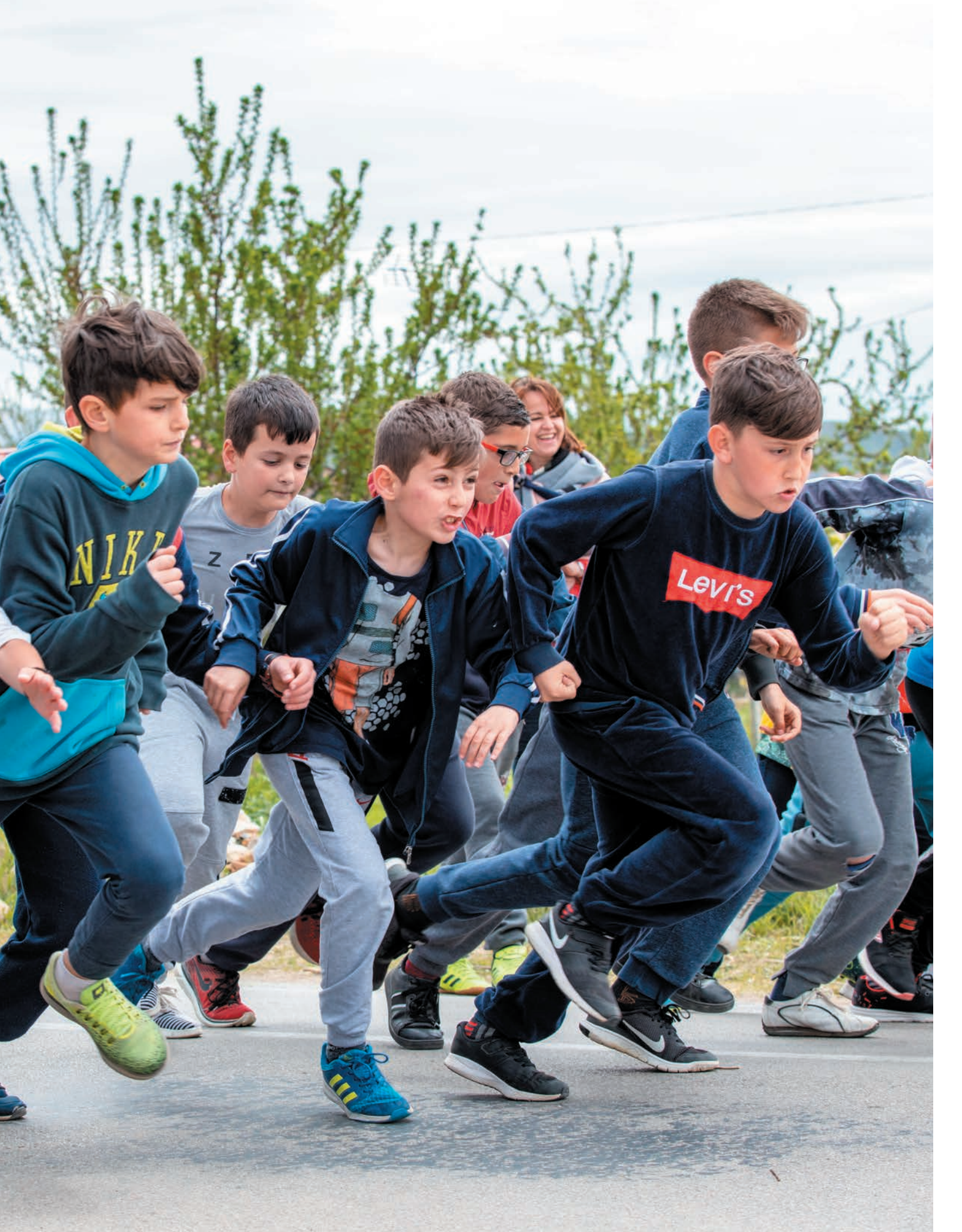
Full speed ahead - students of Nehemia School have fun at the annual spring run.